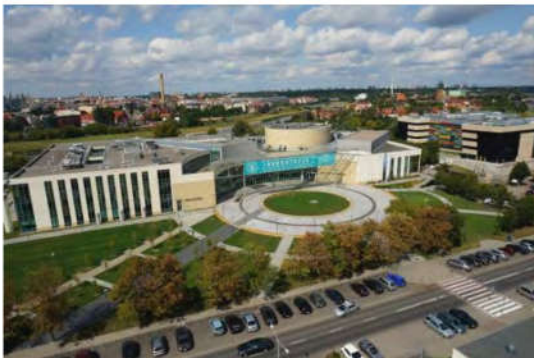
Fig. 1 Poznan University of Technology (Lecture-Conference Center)

The principal organizer of the conference was the European Section of the IEICE (Institute of Electronics, Information and Communication Engineers). The other organizers of the conference, though on a smaller scale, also included the Poznań Division of the Polish Association of Telecommunication Engineers and the Chair in Telecommunications and Computer Networks (Poznań University of Technology). In addition, the ICTF2017 was financially sponsored by the Communications Society of IEICE (IEICE-CS).